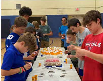
Our students had a great time assembling fishing kits for Operation Christmas Child Shoeboxes!

Be sure to join our Facebook Groups! FCYM 6th-8th Grade FCYM High School