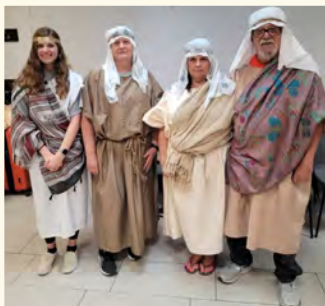
Dressed up for a VBS Skit