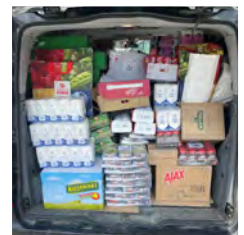
Life Box supplies

These boxes are shipped to families in Ukraine. We purchased the supplies and assembled 50 boxes each day. The entire process took about 6 hours each day. In addition, on one day we unloaded a truck of medical supplies that had come from the US and will be taken to Ukraine. We spent one day working on two mini VBS programs for Ukrainian refugee children. Each VBS had 30 children. The goal was to not only minister to the children but to also strengthen the relationships with Ukrainian mothers and grandmothers.