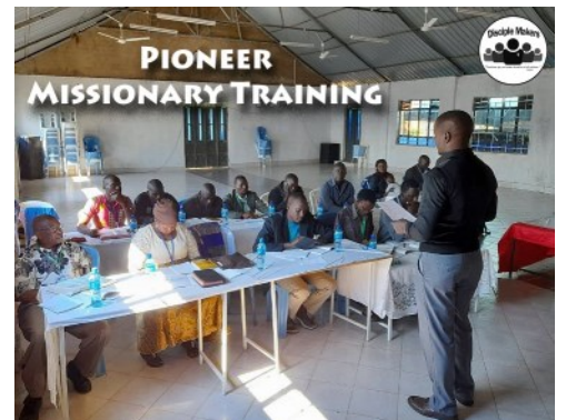
Disciple Makers seeks to spread the Gospel to the unreached people groups of Kenya by training leaders to work among local tribes.